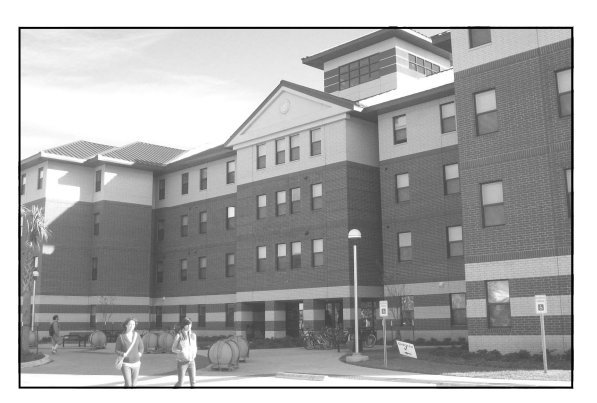
Pontchartrain Hall student dorm

UNO TRAC offers training in assistive technology and computer skills needed for success in college and today's work place. The courses give students opportunities to learn valuable skills,